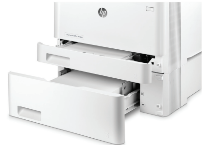
HP LaserJet Pro M452dn with optional 550-sheet tray