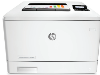
HP LaserJet Pro M452dn

Ideal printing performance and solid security for how you work. This capable colour printer finishes jobs faster and delivers comprehensive security to guard against threats. 1 Original HP Toner cartridges with JetIntelligence produce more pages. 2